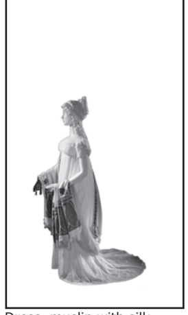
Dress, muslin with silk embroidery, 1800, probably India for the Western market