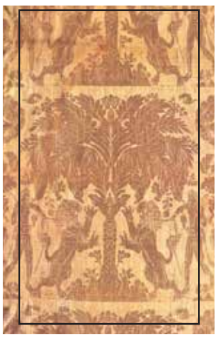
Stand cover, silk with patterns of flowering trees, loins and human figures, 8C, Shōsō-in temple, Japan