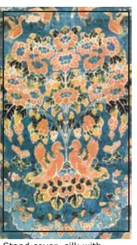
Stand cover, silk with kyokechi-dyed designs of flowering trees and paired-birds, 8C, Shōsō-in templezv Japan