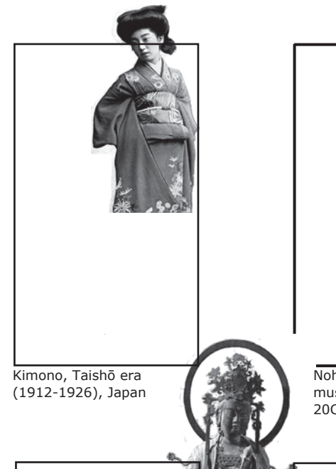
Noh (classical Japanese musical drama) costume, 20C, Japan