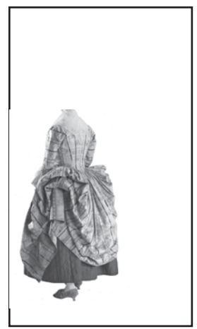
Dress, silk with warp-and weft-float patterning, 1775, France