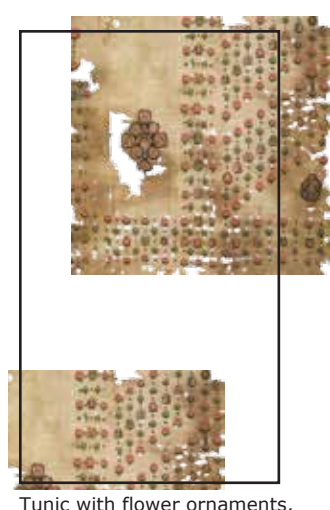
Tunic with flower ornaments, Coptic textile, 9-10C, Egypt