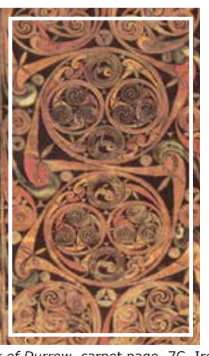
Book of Durrow, carpet page, 7C, Ireland