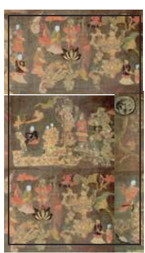
Embroidery on silk, Tenjukoku (Heavenly Paradise) scene, 7C, Chūgū-ji temple, Japan