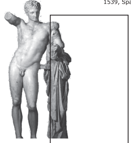
Hermes and the Infant Dionysus, Praxiteles, Unknown, Ancient Greece