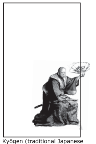
Kyōgen (traditional Japanese comic theater) costume, 20C, Japan