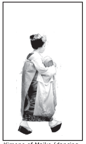
Kimono of Maiko (dancing girl and apprentice geisha), 20C, Japan