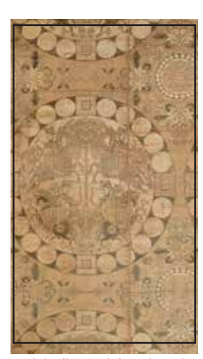
Nishiki (brocade) with archers chasing lions, 7C, Hōryū-ji Temple, Japan