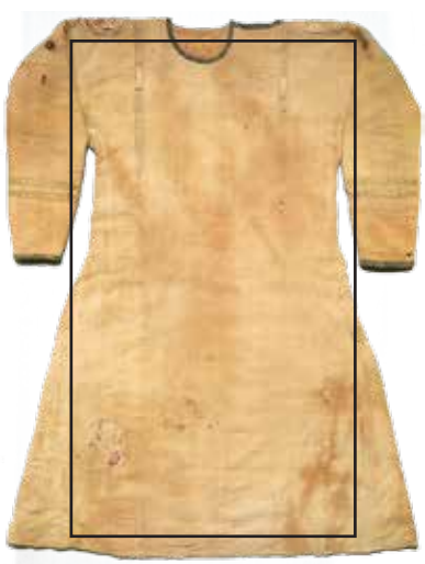
Tunic, Coptic textile, 7C, Egypt