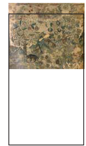
Adam and Eve in the Garden of Eden with Virtues, Gobelin, 17C, England