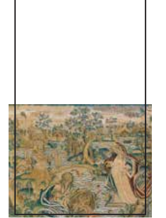
The Finding of Moses, embroidery, 17C, England