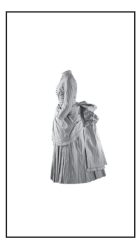
Tennis dress, cotton, 1885, England